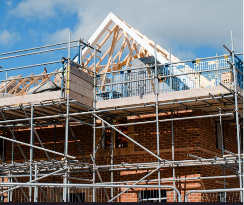
Securing planning permission as quickly as possible

Delivering maximum possible return for landowners